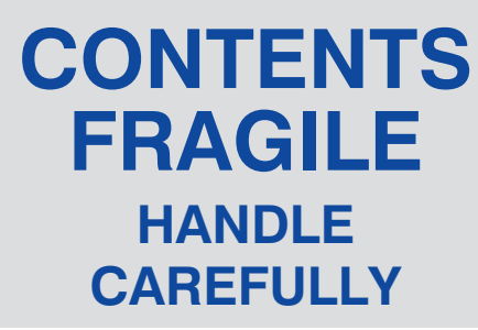
1" x 2-3/4" #5205 One Color Ink Pad Replacement ink pad #6/55

1-9/16" x 2-3/8" #5207 One Color Ink Pad Replacement ink pad #6/57